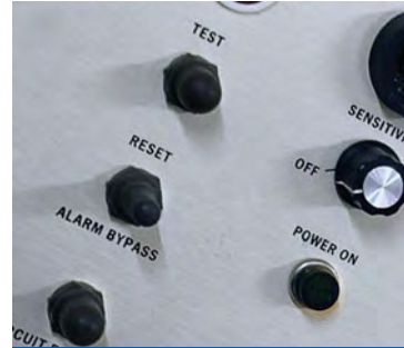
Medical Device Control Panels