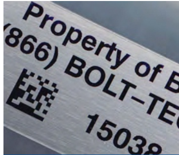
UDI Barcode Asset Identification